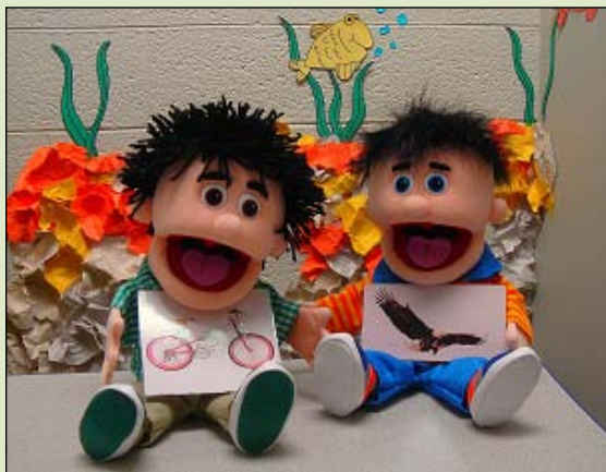
The bicycle and eagle experts

A: An orycteropus has large feet with pointy toes.