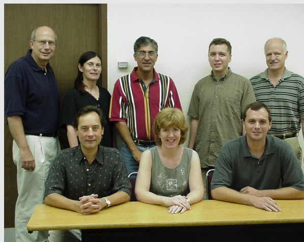
Faculty photo (2001)