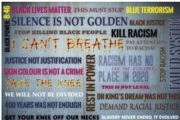
Figure SEQ Figure \* ARABIC 1: Word Cloud Black Lives Matter from HYPERLINK " https://www.lsst.ac/news/stop-systemic-racism/ "

It is a constant struggle to cover all of the topics that are important in a class such as this one. I finally accepted that we simply cannot do so because we need several classes to be knowledgeable about multicultural psychology and to use the information responsibly as scholars and members of society.